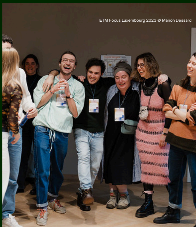
IETM Focus Luxembourg 2023

Perform Europe, Europe Beyond Access, Culture Relations Platform and more