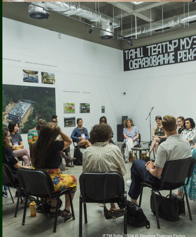
IETM Sofia 2024